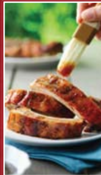
Fig BBQ Glaze