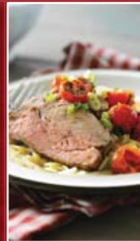
Veal Tenderloin with Grilled Tomatoes