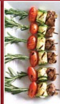
Mediterranean Lamb Skewers