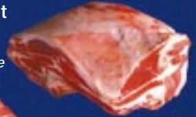
Blade Chop Braise, Broil, Panbroil, Panfry