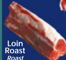
Loin Roast Roast