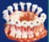
Crown Roast Roast