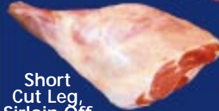
Short Cut Leg, Sirloin Off Roast