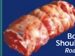
Boneless Shoulder Roast Roast, Braise