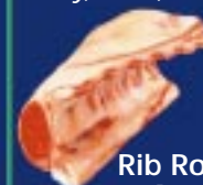
Rib Roast Roast