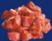
Cubes for Kabobs Broil, Braise, BBQ