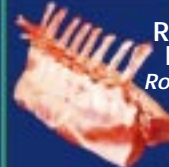
Rack of Lamb Roast, BBQ