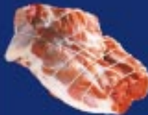
Boneless Leg Roast Roast, Broil if butterflied